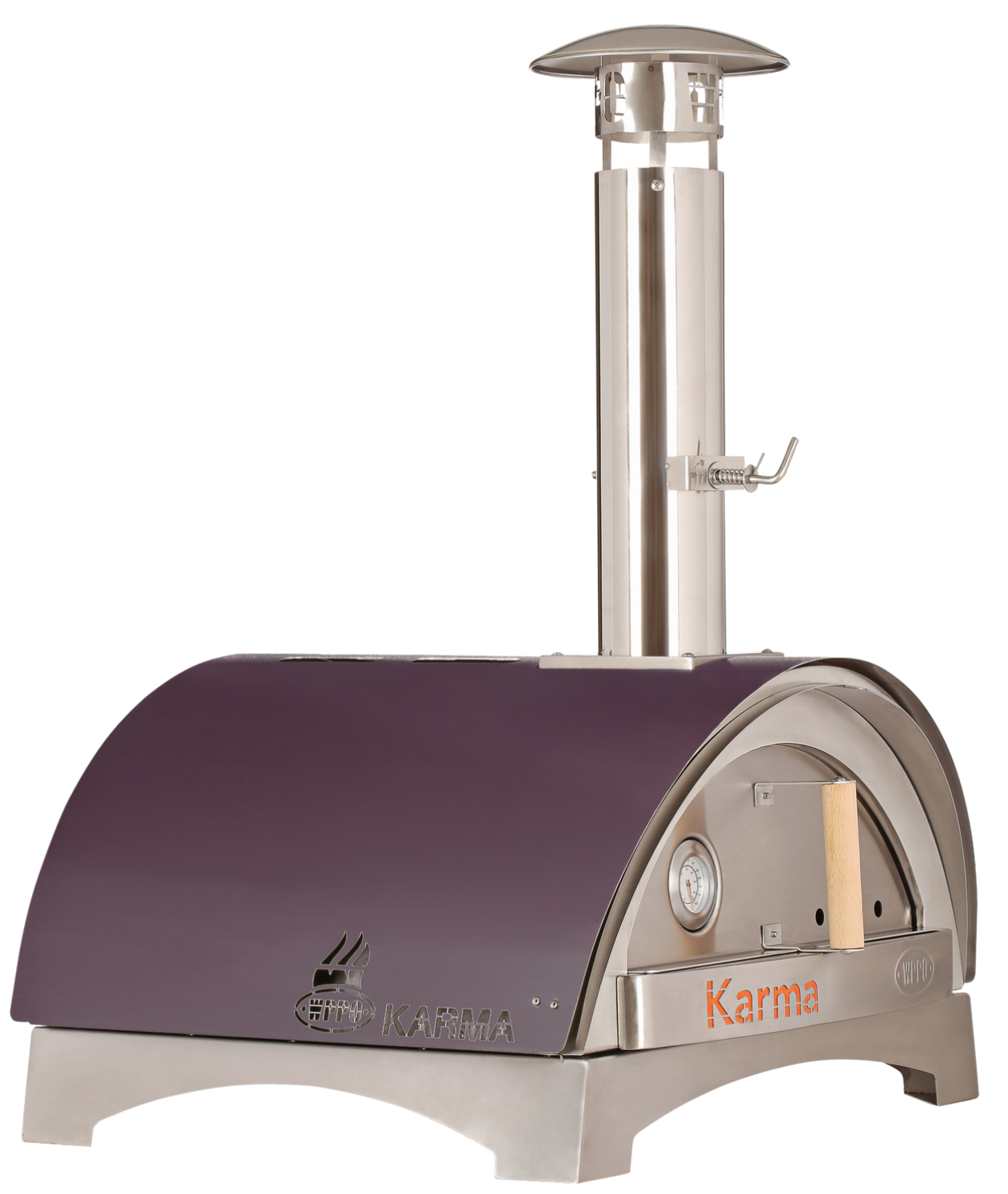
*Wine Red #WKA-HS25-WR