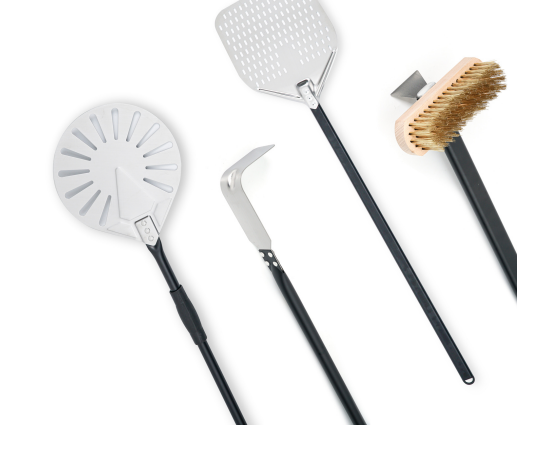
4 Piece Aluminum Handled Pro Accessories Kit