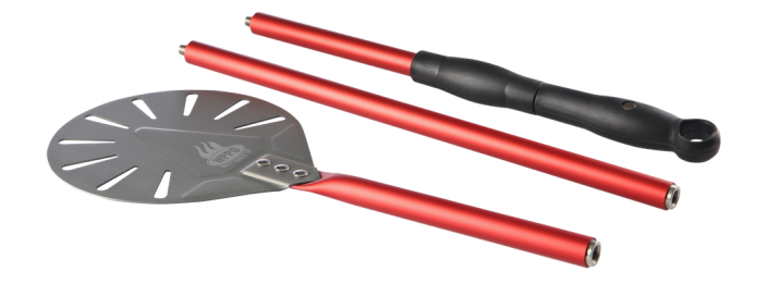
Breakdown Pizza Peel Handle