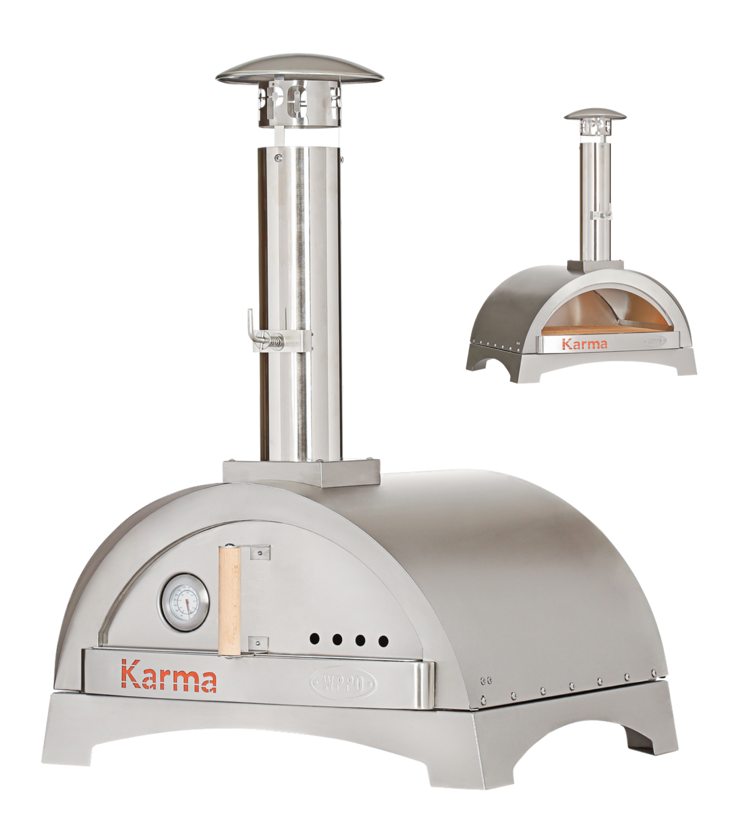
#WKK-01S-304 Karma 25 Oven